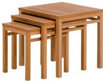
Nest of tables