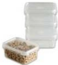
Food storage boxes